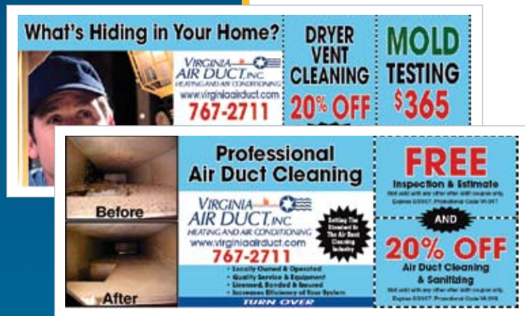
Multi-Insert Split Piece 1