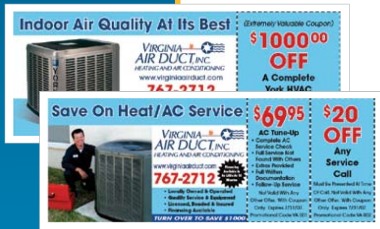
Multi-Insert Split Piece 2