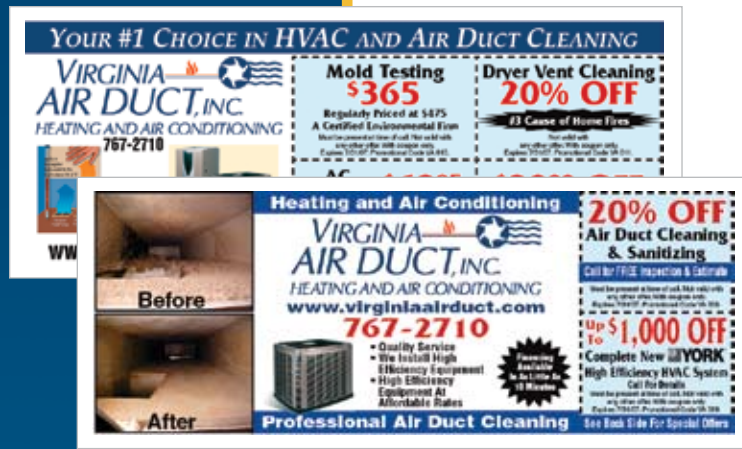
Original Control Piece